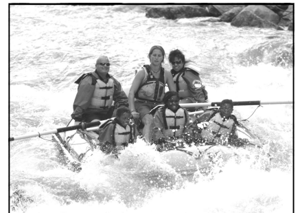
Staff and kids rafting down the Arkansas River during CCN's 2007 summer camping trip

Please invite your friends, family and co-workers—the more the merrier!!